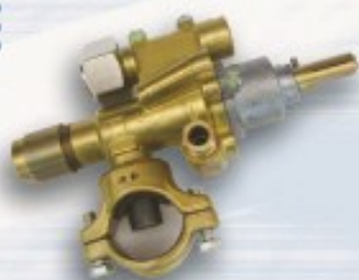
A62U FOR 3/4" PIPE