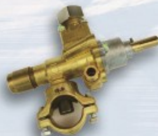
A62VU FOR 3/4" PIPE