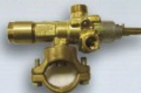
A60U FOR 3/4" PIPE