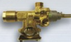
A60S FOR 1/2" PIPE